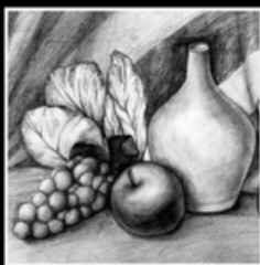
LEARN 2 DRAW DRAWING WORKSHOP