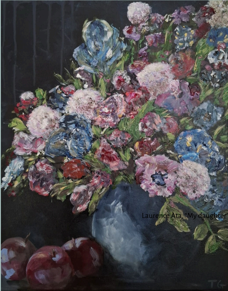
Truida Grove, "Plum Colour Palette Floral"