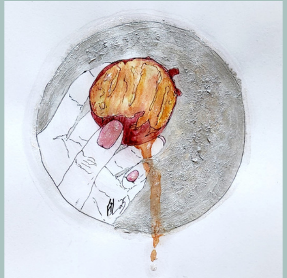
Fil Angelakis, "Juicy Plum", Mixed Media Illustration