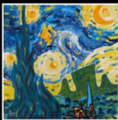
VAN GOGH PAINTING WORKSHOP